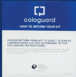
How to return your kit